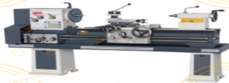
MEDIUM DUTY ALL GEAR LATHE MACHINE UPTO 80MM