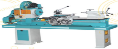
LITE DUTY PRECISION LATHE MACHINE UPTO 40MM