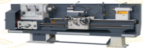
HEAVY DUTY ALL GEAR LATHE MACHINE UPTO 205MM