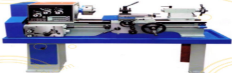
LITE DUTY ALL GEAR LATHE MACHINE UPTO 40MM